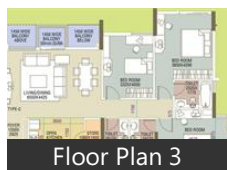
Floor Plan 3