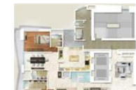
2BHK - Floor Plan