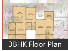
3BHK Floor Plan