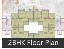
2BHK Floor Plan