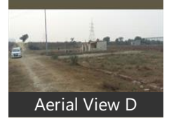
Aerial View D

* These pictures are of the project and might not represent the property