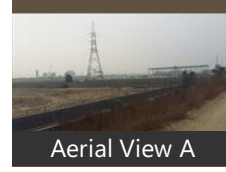
Aerial View A