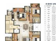
Floor Plan C