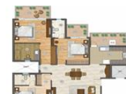
Floor Plan B