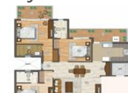
Floor Plan A