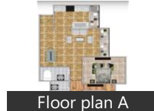
Floor plan A