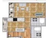
Floor plan D