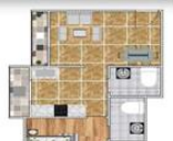
Floor plan B