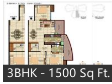
3BHK - 1500 Sq Ft.