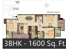
3BHK - 1600 Sq. Ft.