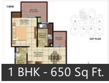
1 BHK - 650 Sq Ft.