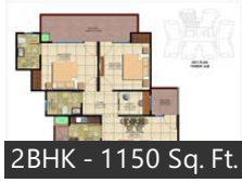
2BHK - 1150 Sq. Ft.