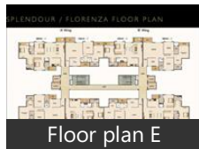
Floor plan E