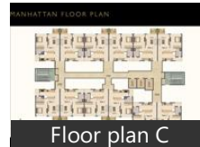
Floor plan C