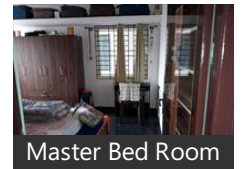
Master Bed Room