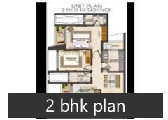
2 bhk plan