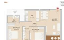
Floor Plan- A