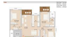
Floor Plan- B