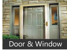
Door & Window