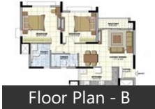
Floor Plan - B