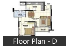
Floor Plan - D