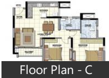
Floor Plan - C