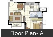
Floor Plan - A