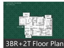
3BR+2T Floor Plan