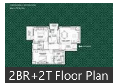
2BR+2T Floor Plan