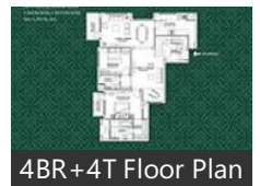
4BR+4T Floor Plan

* These floor plans are of the project and might not represent the property