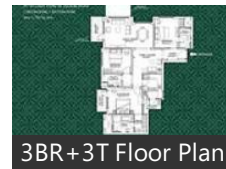
3BR+3T Floor Plan