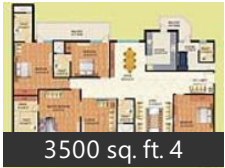
3500 sq. ft. 4