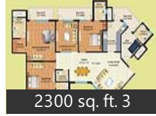
2300 sq. ft. 3