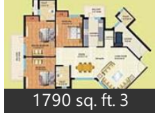
1790 sq. ft. 3