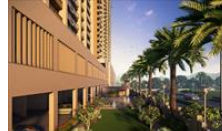
Back Garden View