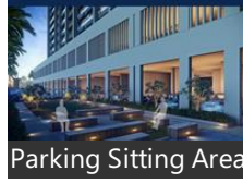
Parking Sitting Area