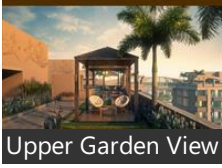
Upper Garden View