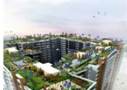
Bird Eye View