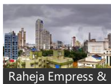
Raheja Empress &