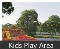
Kids Play Area