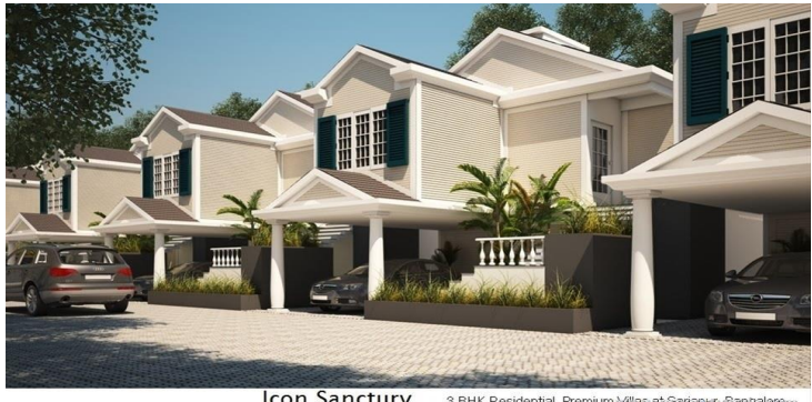
icon Sanctury ദലർക്ക് മാലം പ്രത്യായം പ്രത്യായം പ്രത്യായം പ്രത്യായം പ്രത്യായം പ്രത്യായം പ്രത്യായം പ്രത്യായം പ്രത്യായം പ്രത്യായം പ്രത്യായം പ്രത്യായം പ്രത്യായം പ്രത്യായം പ്രത്യായം പ്രത്യായം പ്രത്യായം പ്രത്യായം പ്രത്യായം പ്രത്യായം പ്രത്യായം പ്രത്യായം പ്രത്യായം പ്രത്യായം പ്രത്യായം പ്രത്യായം പ്രത്യായം പ്രത്യായം പ്രത്യായം പ്രത്യായം പ്രത്യായം പ്രത്യായം പ്രത്യായം പ്രത്യായം പ്രത്യായം പ്രത്യായം പ്രത്യായം പ്രത്യായം പ്രത്യായം പ്രത്യായം പ്രത്യായം പ്രത്യായം പ്രത്യായം പ്രത്യായം പ്രത്യായം പ്രത്യായം പ്രത്യായം പ്രത്യായം പ്രത്യായം പ്രത്യായം പ്രത്യായം പ്രത്യായം പ്രത്യായം പ്രത്യായം പ്രത്യായം പ്രത്യായം പ്രത്യായം പ്രത്യായം പ്രത്യായം പ്രത്യായം പ്രത്യായം പ്രത്യായം പ്രത്യായം പ്രത്യായം പ്രത്യായം പ്രത്യായം പ്രത്യായം പ്രത്യായം പ്രത്യ