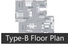
Type-B Floor Plan