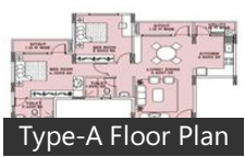
Type-A Floor Plan