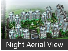
Night Aerial View