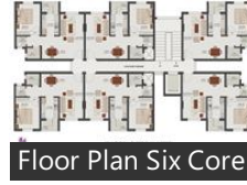
Floor Plan Six Core