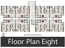
Floor Plan Eight