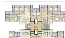
Floor plan B