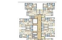
Floor plan E