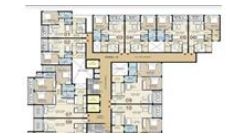
floor plan D