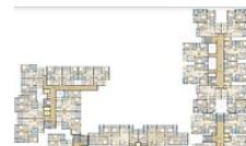
Floor plan F

* These floor plans are of the project and might not represent the property