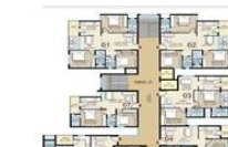
Floor Plan c