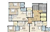
Floor plan A

Disclaimer: All information is provided by advertisers and should be verified independently before entering into any transaction. You may visit the relevant RERA website of your state to verify the details of this property. PropertyWala.com is only an advertising platform to help connect buyers and sellers and is not a party to any transactions, nor shall be responsible or liable to resolve any disputes between them.