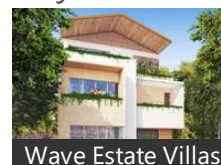
Wave Estate Villas