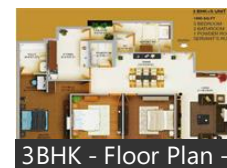
3BHK - Floor Plan -