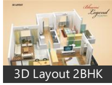
3D Layout 2BHK