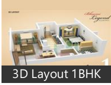
3D Layout 1BHK