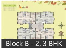
Block B - 2, 3 BHK