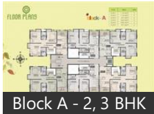
Block A - 2, 3 BHK