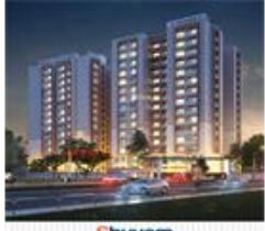
Shuvam AVENUE GHATIKIA