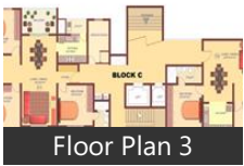
Floor Plan 3