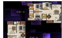
Flat 3, 4 Floor Plan