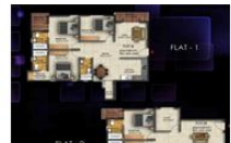
Flat 1, 2 Floor Plan