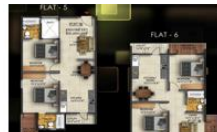
Flat 5, 6 Floor Plan