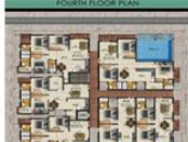
Typical Floor Plan B