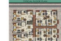
Typical Floor Plan A