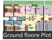
Ground floor Plot -