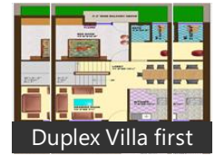
Duplex Villa first