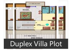
Duplex Villa Plot

* These floor plans are of the project and might not represent the property