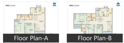
* These floor plans are of the project and might not represent the property

Posted: Oct 22, 2020 by Feroz Khan (F 5 K Realty Bangalore)