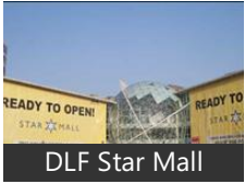
DLF Star Mall