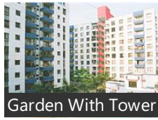
Garden With Tower