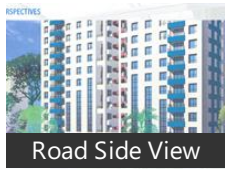
Road Side View