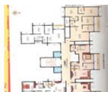
2BHK - Floor Plan