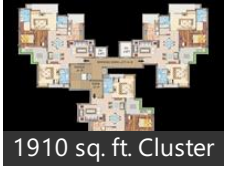
1910 sq. ft. Cluster