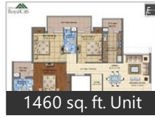
1460 sq. ft. Unit