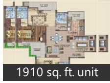
1910 sq. ft. unit