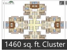
1460 sq. ft. Cluster