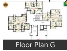
Floor Plan G