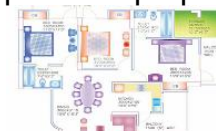
3 BR with