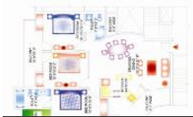
3 BR with