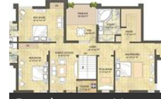
Penthouse - Upper