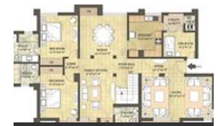
Penthouse - Lower