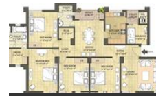
4 Bedroom +

Disclaimer: The reviews are opinions of PropertyWala.com members, and not of PropertyWala.com.