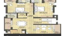
Penthouse - Lower

* These floor plans are of the project and might not represent the property