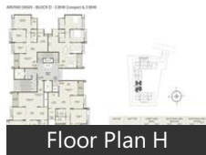
Floor Plan H