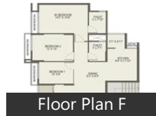
Floor Plan F