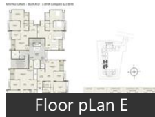
Floor pLan E