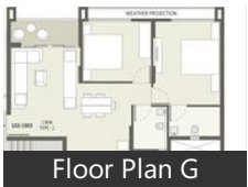
Floor Plan G