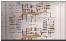
1st to 4th Floor Plan