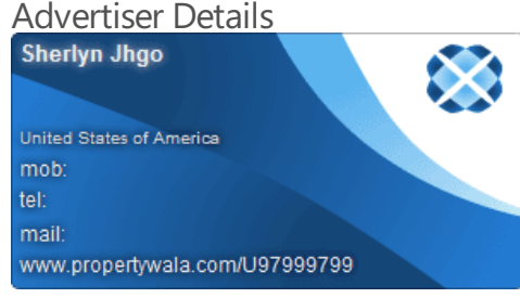
Scan QR code to get the contact info on your mobile