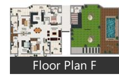
* These floor plans are of the project and might not represent the property