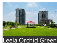
Leela Orchid Greens