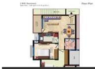
2BHK - 1186 Sq Ft