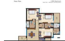
3BHK Floor Plan