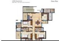
4BHK Floor Plan

* These floor plans are of the project and might not represent the property