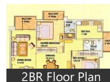
2BR Floor Plan