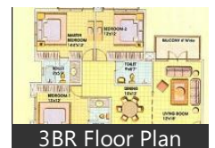
3BR Floor Plan