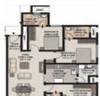
Floor Plan G