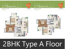
2BHK Type A Floor