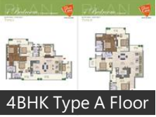
4BHK Type A Floor