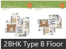
2BHK Type B Floor