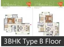
3BHK Type B Floor