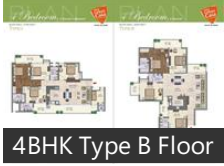
4BHK Type B Floor