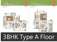
3BHK Type A Floor