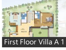
First Floor Villa A 1