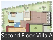
Second Floor Villa A