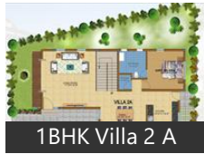
1BHK Villa 2 A