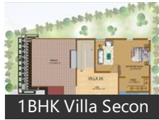
1BHK Villa Secon