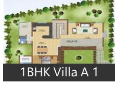
1BHK Villa A 1