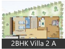
2BHK Villa 2 A