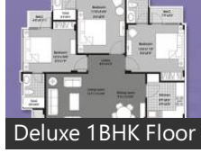
Deluxe 1BHK Floor