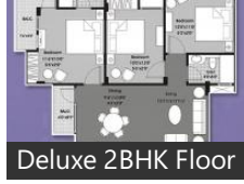
Deluxe 2BHK Floor