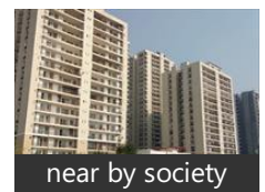
near by society